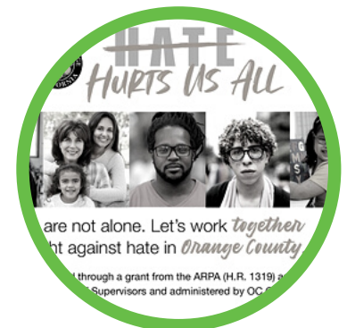
2021 OC Hate Crimes Report